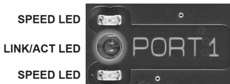
Figure 5-1 : Status LEDs